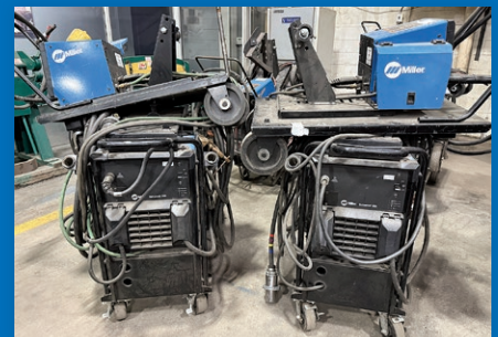
(40+) Lincoln and Miller Welders and Welding Equipment