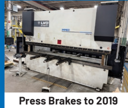
Press Brakes to 2019