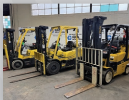
Late Model Forklifts to 12,000 Lb. Cap.