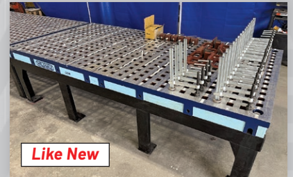
Large Quantity Welding Equipment Including Precision Welding Tables