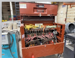
Job Boxes Loaded w/ Tools