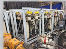
(50) Electric Hoists to 5-Ton Cap.