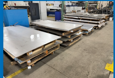
Large Sheet and Plate Inventory