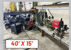
40' X 15'