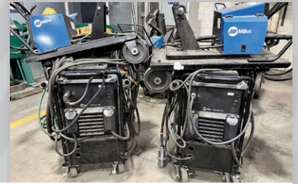
(40+) Lincoln and Miller Welders and Welding Equipment