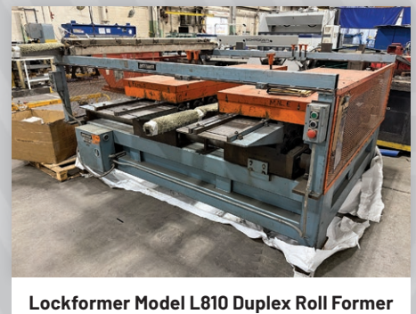
Lockformer Model L810 Duplex Roll Former