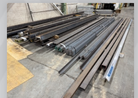
Structural Steel and Pipe Inventory