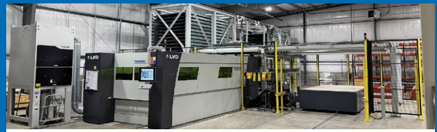
2025 LVD 12-KW Phoenix CNC Fiber Sheet Laser & Tower