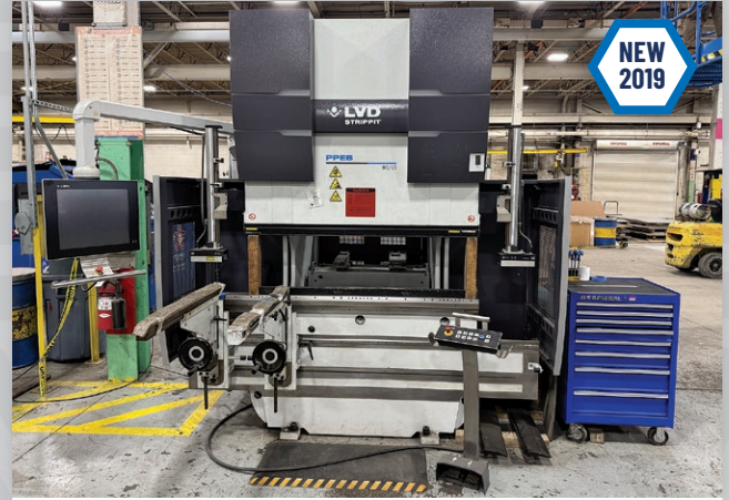
2019 LVD Strippit 88 Ton x 59" Model PPEB 7-Axis CNC Hydraulic Press Brake