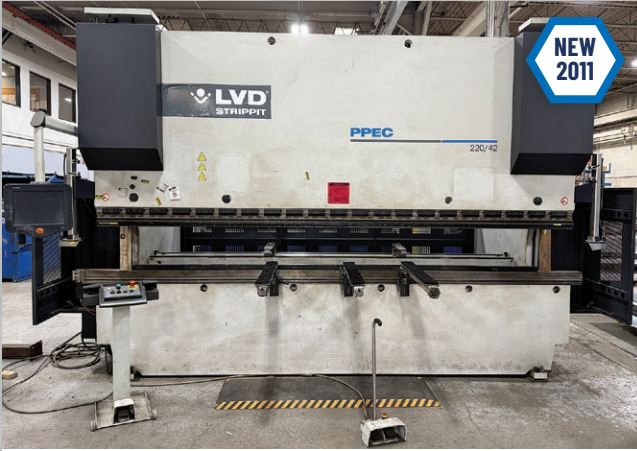
LVD Strippit 220 Ton x 168" Model PPEC-L 7-Axis CNC Press Brake