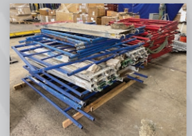
(250+) Lots Job Site Contractors Tools and Equipment