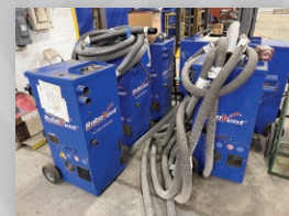
Robovent Fume Collectors