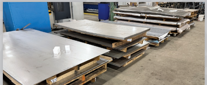
Large Sheet and Plate Inventory