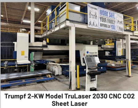
Trumpf 2-KW Model TruLaser 2030 CNC CO2 Sheet Laser