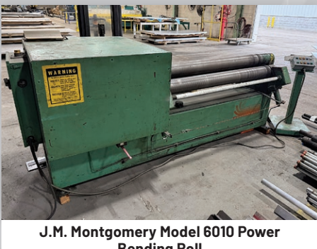
J.M. Montgomery Model 6010 Power Bending Roll