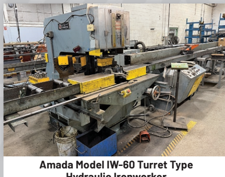
Amada Model IW-60 Turret Type Hydraulic Ironworker