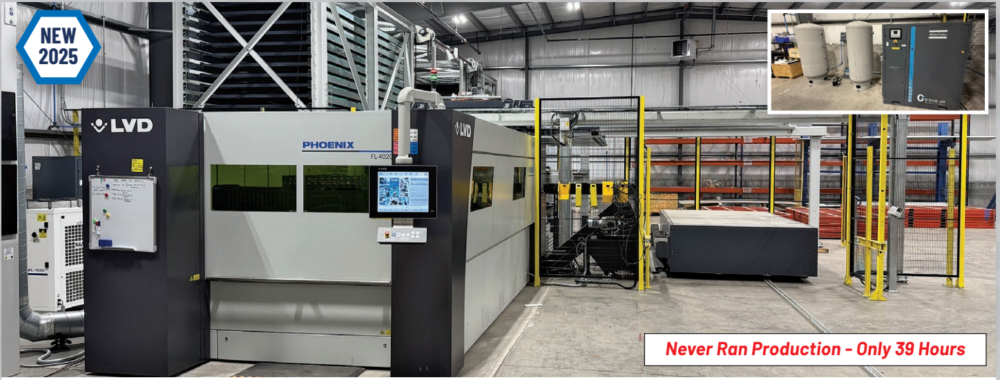
2025 LVD 12-KW Phoenix + TAS FL-4020 CNC Fiber Sheet Laser & Tower, 80" x 160" Max. Sheet Size, Well Optioned