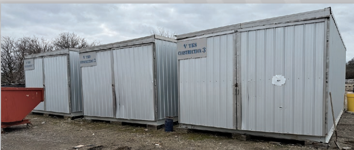
14' X 20' Custom Built Portable Buildings