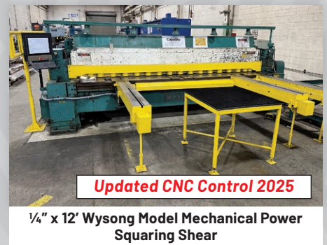
1/4" x 12' Wysong Model Mechanical Power Squaring Shear