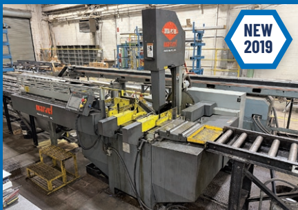
Amada 15" x 20" V380-PC3-60 Auto Tilt Frame Band Saw