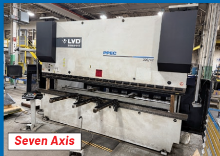
LVD Strippit 220 Ton x 168" Model PPEC-L-7 CNC Press Brake