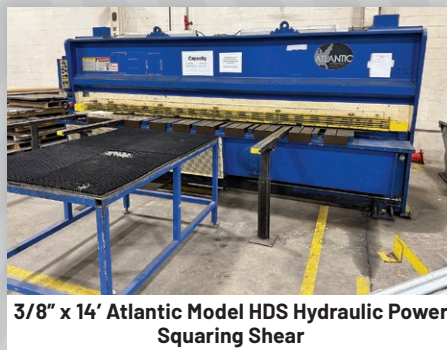
3/8" x 14' Atlantic Model HDS Hydraulic Power Squaring Shear