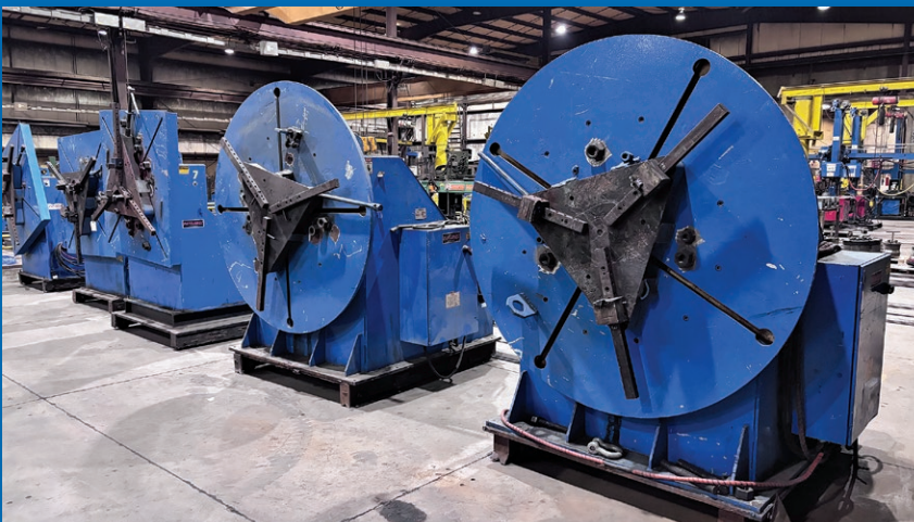
(30+) HD Positioners up to 60,000 LB