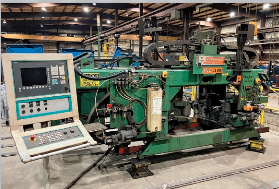
Peddinghaus PCD 1100 Drill Line