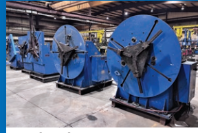
(30+) HD Positioners