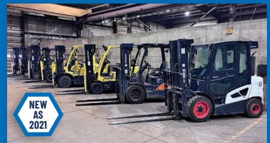
(10+) Lift Trucks up to 15,000 LB