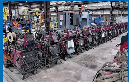
(70+) Welders by Lincoln + Miller