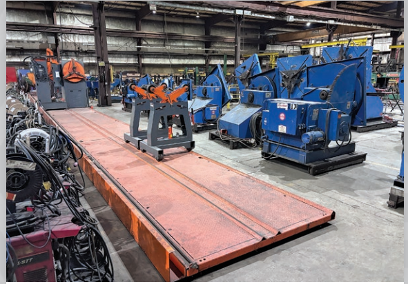
Tecnar Rotoweld 3.0 Twin Bay Pipe Spool Welding System