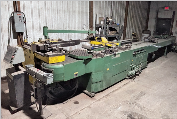
6" Pines No. 4 Tube Bender