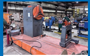
Specialty Pipe Equipment