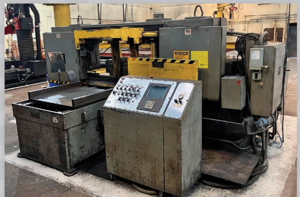
HEM 2000-30A Automatic Horizontal Band Saw