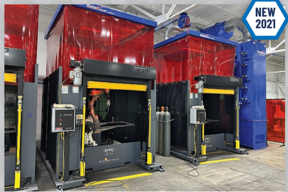
(3) OTC Eco-Arc 200 Robotic Welding Cells

REAL ESTATE FOR SALE/LEASE CONTACT AUCTIONEER FOR MORE INFO