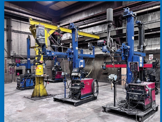
Manipulators by Lincoln + Pandjiris