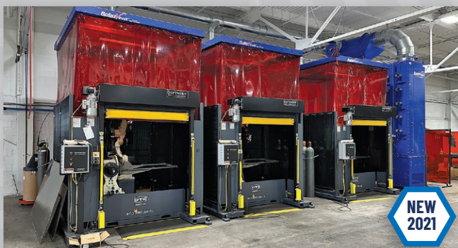
****(3) OTC Model Eco-Arc 200-CS Robotic Welding Cells, Robot, Tilt-Rotate Positioner, Pendant, Complete Skid Mount and Enclosure, RoboVent Model MLS-01-5500 Spire Self Cleaning Cartridge Dust Collector **Located offsite in Cleveland, OH** (New 2021 - Never Used in Production)