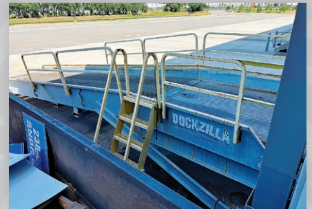
8' Wide x 38' Long Dockzilla Dock Ramp