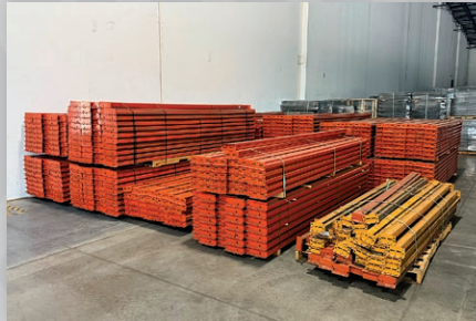
(800) 6" x 144" Beams - New Never Used