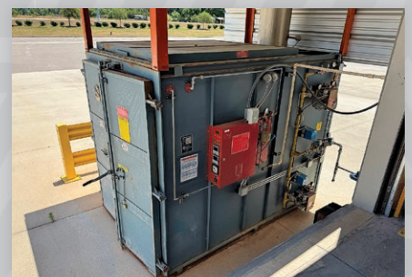
Pollution Control Products Model PRC 260 Natural Gas Burn Off Oven