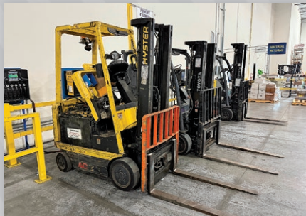
3,500 Lb. Hyster Model E352 Electric Lift Truck