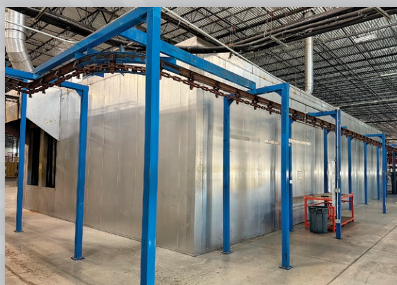
71' Long x 25' Wide x 14'6" High American Industrial Systems Natural Gas Cure-Oven (Refurbished 2022)