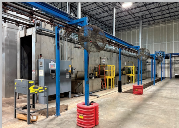
80' American Industrial Systems Three-Stage Stainless Steel Pass Thru Washer; 4' x 7'8" Window (Refurbished 2022)