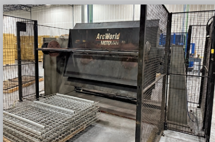
Motoman Robotic Welding Cell, (2) Motoman YR-EA1400NA00 Robots, (2) Miller Access 300 Welders, (2) 44" x 96" Stations (2006)