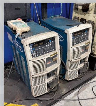
Daihen OTC Robotic Welding Cell, (2) OTC Robots, Controller, (2) OTC Welders, Torch Cleaner, (2) 36" x 104" Welding Trunions (2015)