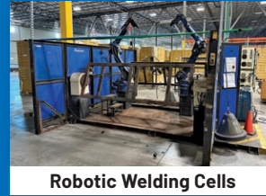
Robotic Welding Cells