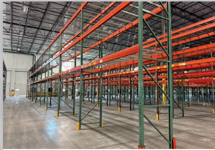
(198) Sections 42" x 144" x 17' High Tear Drop Adjustable Beam Pallet Rack with Decking