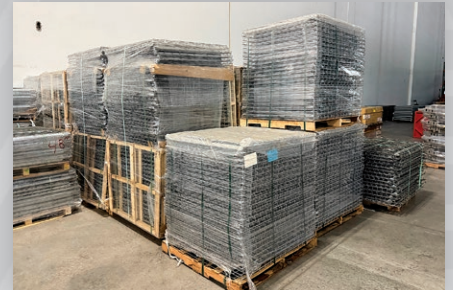
(45) Skid Wire Decking - Some New Never Used