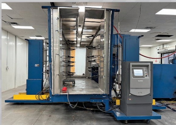
(2) Nordson Excel 2000 Stainless Steel Sixteen-Gun Automatic Pass Thru Powder Coat Booths (Refurbished 2022)