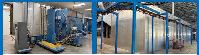
$1.5 Million Powder Coat Line (New/Refurbished in 2022)