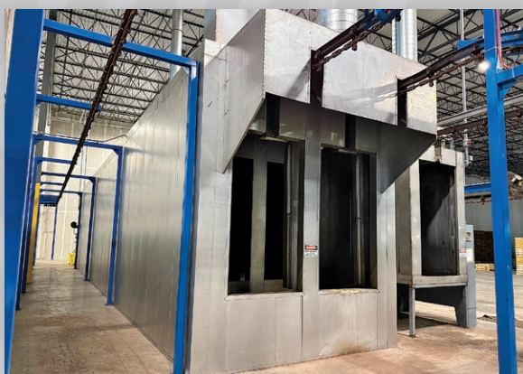
61' Long x 11' Wide x 14'6" High American Industrial Systems Natural Gas Dry-Oven (Refurbished 2022)