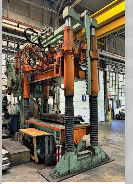
155 Ton Midwest Tilting Bed & Platen Hydraulic Spotting Press