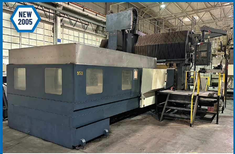
Johnford Model DMC-4000x2500x1066 Three-Axis CNC Bridge Type Vertical Machining Center (11/2005)