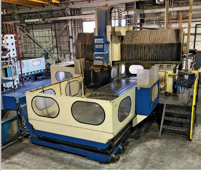
Johnford Model DMC-3000 Three-Axis Bridge Type CNC Mill