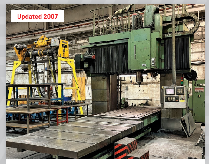
SNK Model 3PK Super Three-Axis CNC Bridge Type Mill