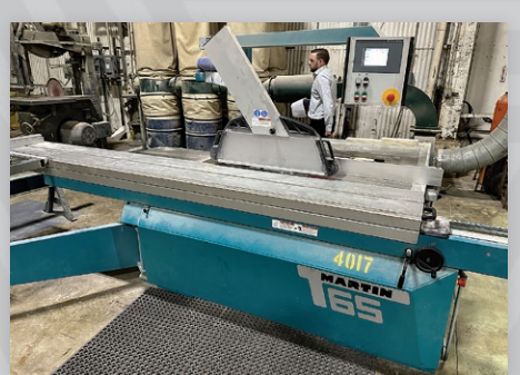
Martin Model T-65 Sliding Table Panel Saw (2015)