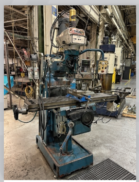
3 HP Atrump Model K3V Vertical Milling Machine