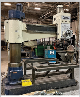
6′ x 15″ Column Clausing Model CL-C1600 Radial Arm Drill