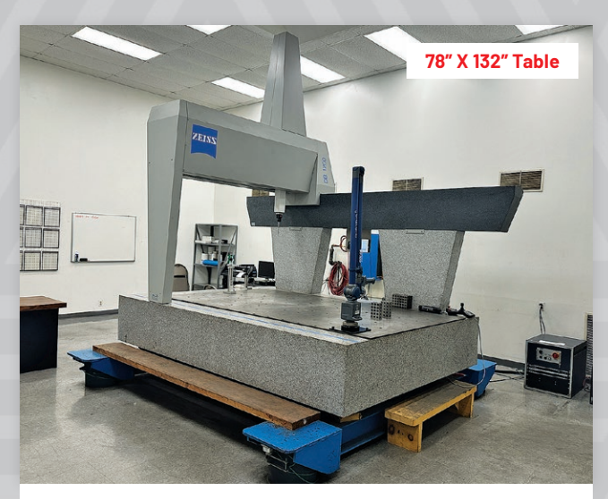
Zeiss Model DB-1200 CNC Coordinate Measuring Machine