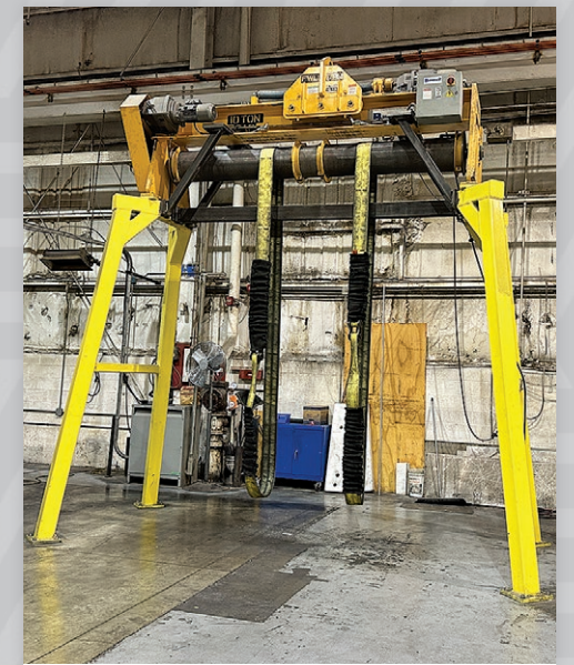
10 Ton Bushman Free-Standing Flip-Rite Mold Flipper