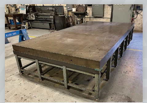
(10) Large Capacity Heavy Steel Mold Repair Tables to 12'