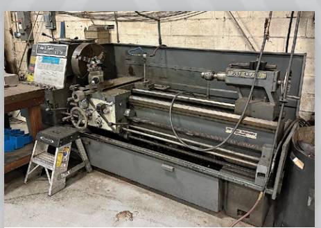
24" x 60" Lodge & Shipley Model Blue Chip Geared Head Engine Lathe