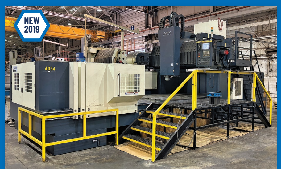
Johnford Model DMC-4100PH Three-Axis CNC Bridge Type Vertical Machining Center (1/2019)

INSPECTION: Day prior to Auction from 10:00AM to 4:00PM or by appointment with jeffjr@cia-industrial.com