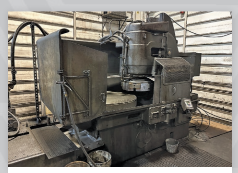
Blanchard Rotary Surface Grinder