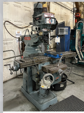
(2) Clausing Model FV-300 Vertical Milling Machines