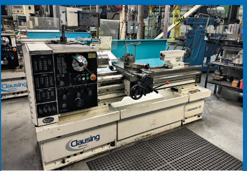
Toolroom Machinery Including Mills, Lathes, Radial Drills

CIA-INDUSTRIAL.COM 2020 DUNLAP ST.,CINCINNATI, OH 45214 513.241.9701