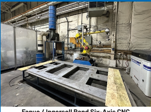
Fanuc / Ingersoll Rand Six-Axis CNC Water Jet Cutting Cell