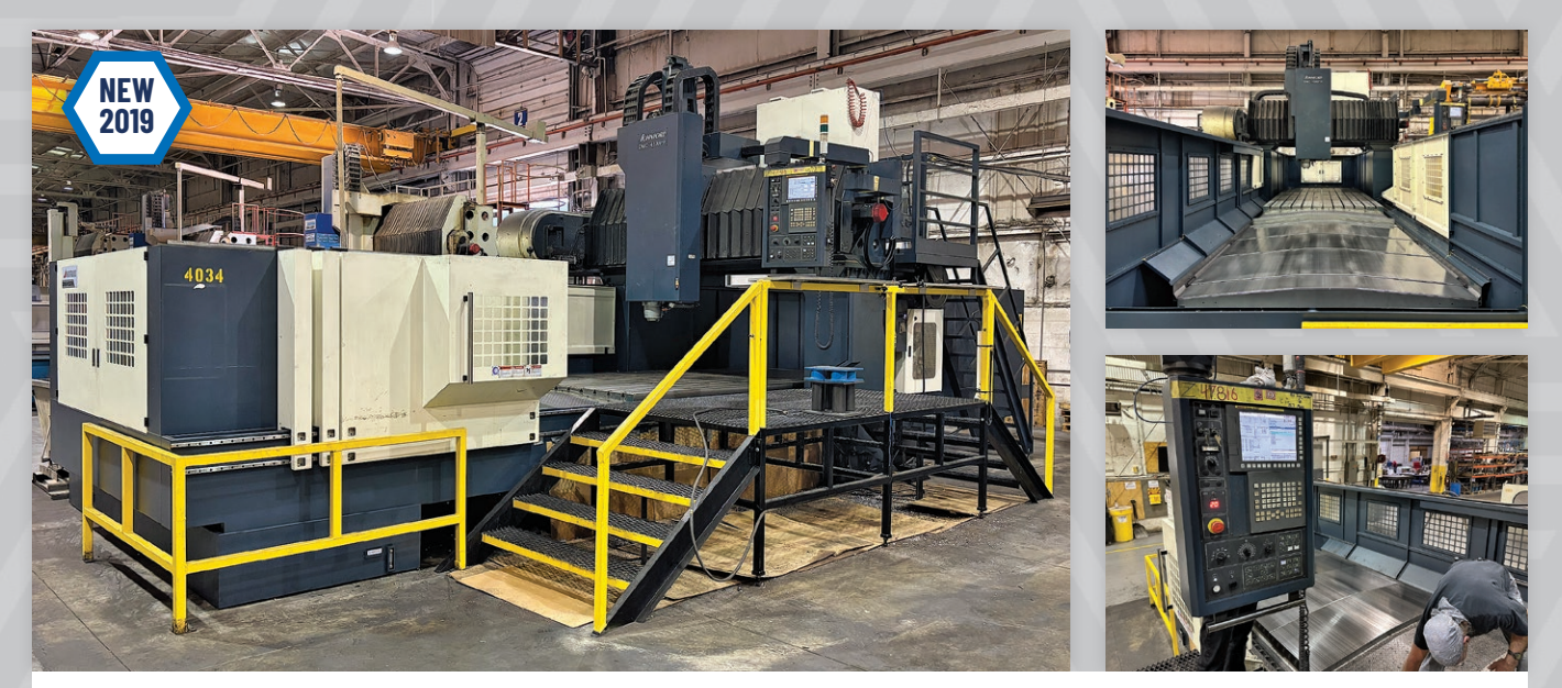
Johnford Model DMC-4100PH Three-Axis CNC Bridge Type Vertical Machining Center (New 1/2019)