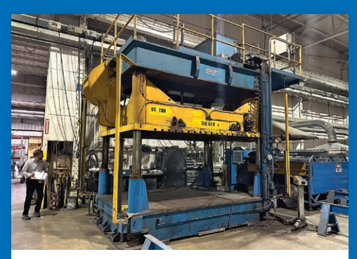
95 Ton Findlay Four-Post Hydraulic Press