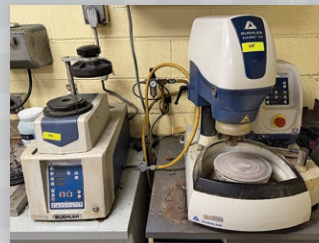
Buehler Lab Equipment