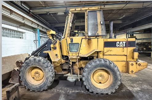
Cat IT-12B Loader