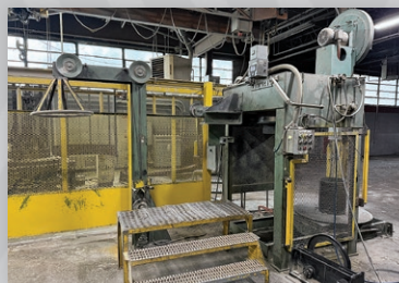
Robinson (Renco) Inverted Bull Block