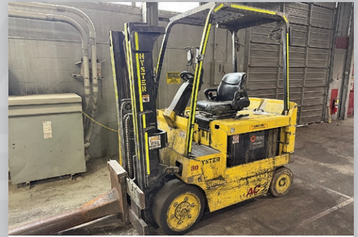
10,000 Lb. Hyster Electric Forklift