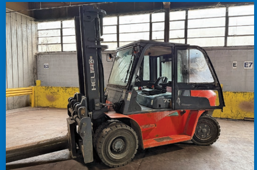
(10) Forklifts to 22,000 Lb.