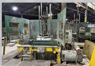
1" Bengison U20 Bull Block