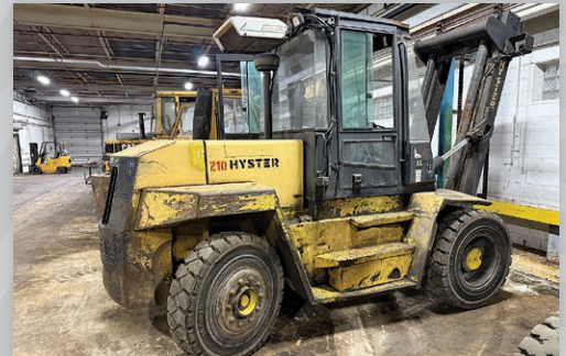
21,000 Lb. Hyster Diesel Forklift