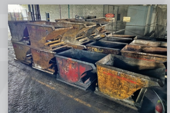
(30) Dump Hoppers