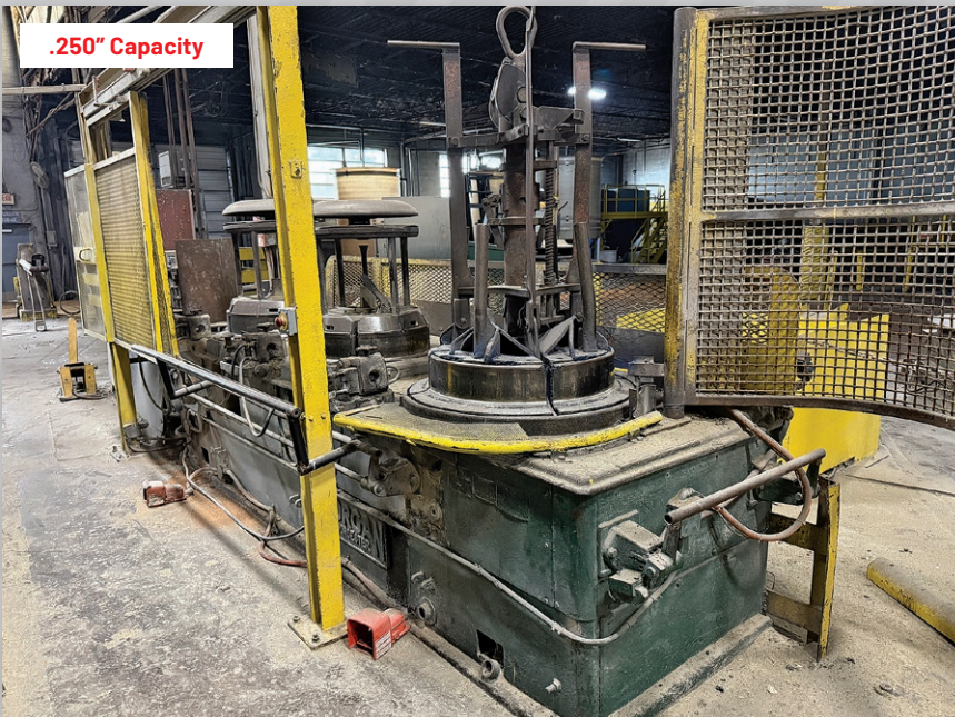
Morgan 2-Block Wire Drawer, 24" Blocks / 30" Finishing Block, 250-HP, ABB Drive