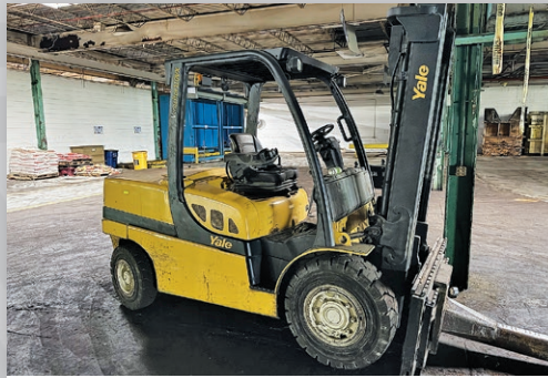
11,000 Lb. Yale Diesel Forklift