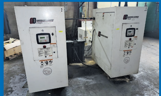
Gardner Denver Air Compressors