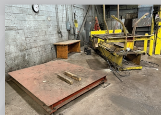
20K Platform Scale