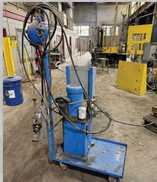
(5) Hydraulic Wire Cutters