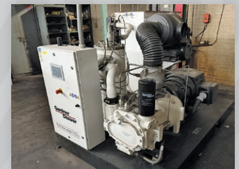
75-HP Gardner Denver Air Comp