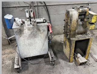
Butt Welders and Wire Pointers