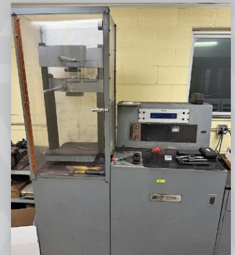
Satec Baldwin Tensile Tester