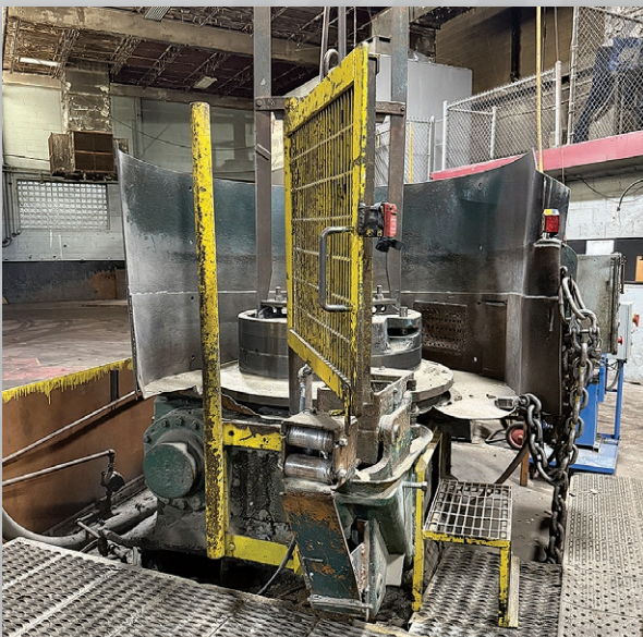
1" Vaughn Motobloc Bull Block