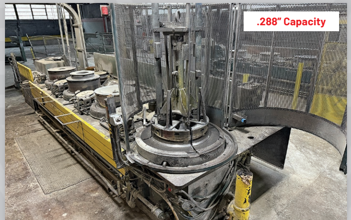
Vaughn Motoblox Model 4/5-HRM 3-Block Wire Drawer