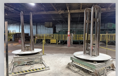
Hydraulic Wire Uncoilers