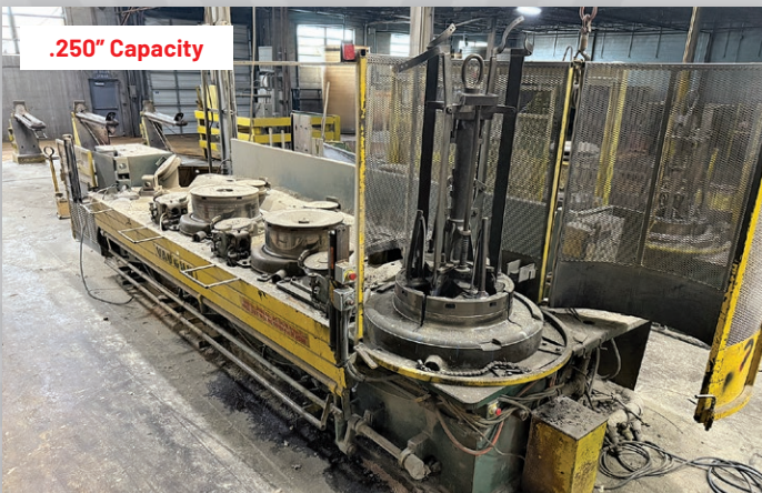
Vaughn Ringblox Model 4/5-HRM 3-Block Wire Drawer