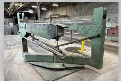
Z Flipper Payoff Units