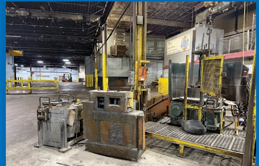
1" Vaughn Motobloc Bull Block