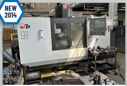
Haas Model TM-2P CNC Vertical Machining Center