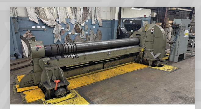
150" x 12" Dia. Bertsch Mechanical Plate Roll