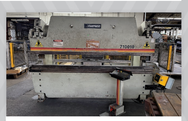
100 Ton x 10' Accurpress 710010 Hydraulic Press Brake