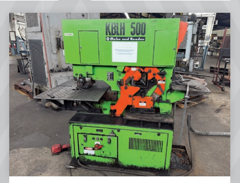
55 Ton Mubea Model KBLH-500 Ironworker