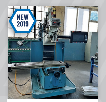
Trak Model DPMRX3 CNC Bed Mill