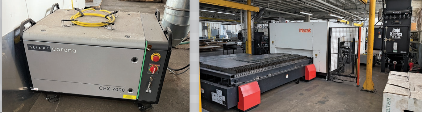
7,000-Watt Mazak Model Optiplex Nexus 3015 Fiber S7 CNC Laser