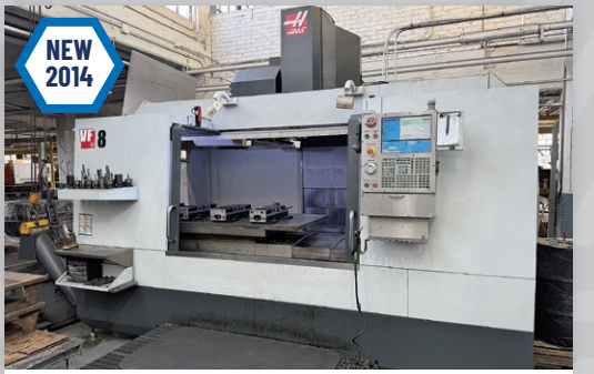
Haas Model VF-8/40 CNC Vertical Machining Center