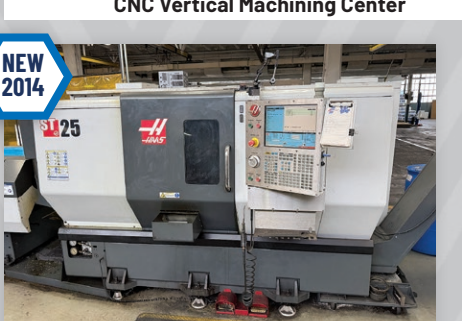
Haas Model ST-25 Two-Axis Slant Bed CNC Turning Center w/ Bar Feed