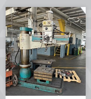
Clausing Radial Arm Drill