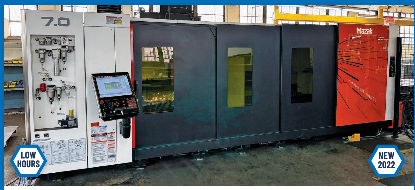
7,000-Watt Mazak Model Optiplex Nexus 3015 Fiber S7 CNC Laser - Under 1,500 Hours

INSPECTION: Day prior to Auction from 10:00AM to 4:00PM or by appointment with jeffjr@cia-industrial.com