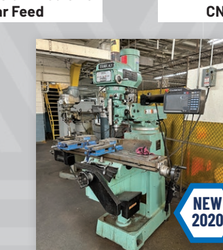
Trak Model K3 CNC Vertical Mill