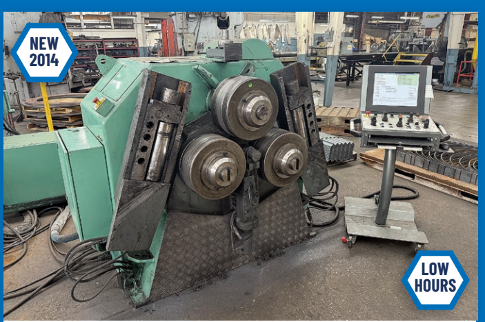
5″ x 5″ x ½″ Roundo Model R-52-S Hydraulic CNC Vertical Angle Bending Roll