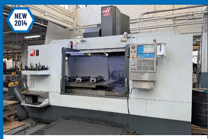
Haas Model VF-8/40 CNC Vertical Machining Center