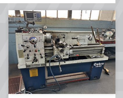
14" X 40" Cincinnati Engine Lathe