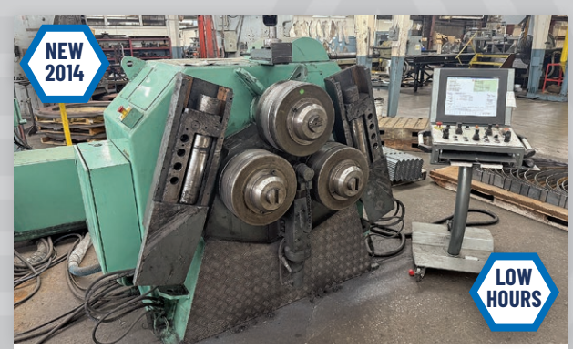
5″ x 5″ x ½″ Roundo Model R-52-S Hydraulic CNC Vertical Angle Bending Roll – Low Hours